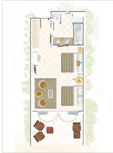
Deluxe Room / Deluxe Ground Floor