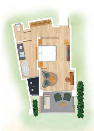
Ocean View Room