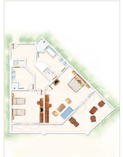
2-Bedroom Family Apartment