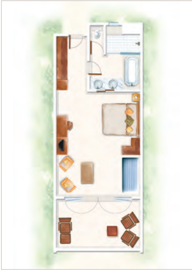
Superior Room First Floor